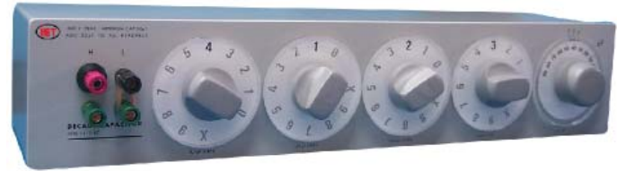
Model 1412-BC Decade Capacitor

For decades of polystyrene capacitors and a variable air capacitors are used, mounted in a double-shield box. The double shielding provides 2-terminal and 3-terminal capacitance's that are the same except for the capacitance between the terminals. The variable air