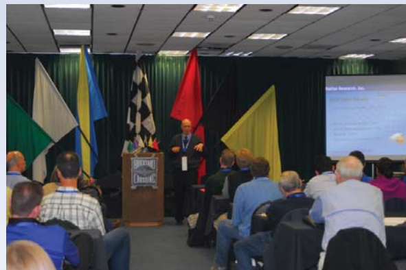
Radian Sales Conference at the Indy 500 Speedway Indianapolis, Indiana

At the close of the event, it was obvious that both the Radian sales and marketing team and the field representatives walked away with an enhanced understanding of providing value and solutions to our customers. Radian is dedicated and focused on providing solutions to the power and energy measurement community that are second to none.