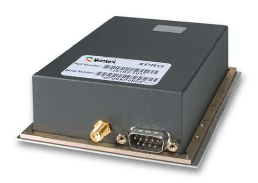
XPRO High-Performance Rubidium Oscillator